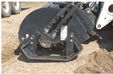
62 in. and 76 in. Tillers have manual depth adjustments of 2, 4 and 6-inch depths